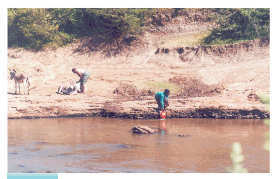
Bordering on a Water Crisis: The Need for Integrated Resource Management in the Mara River Basin

One of the major constraints on sustainable development in the semi-arid areas of Africa is the supply and access to a range of natural resources underpinned by water. Water is needed to support domestic use, agriculture and the preservation of wildlife. With increasing human populations and drive for development, pressure is exerted to harness water resources for higher economic uses instead of developing and adopting an integrated approach. In an integrated approach the various needs and provisions for sustainable livelihoods and ecosystem conservation are assessed and balanced. However, the linkages between water resource management, sustainable livelihoods and biodiversity conservation are poorly known. As a result river basin management programmes and policy initiatives in Africa have evolved independently, often with overlapping and/or conflicting goals and responsibilities. The outcomes from this have been persistent within-country and trans-boundary conflicts; leading to increased poverty and declines in biological diversity.