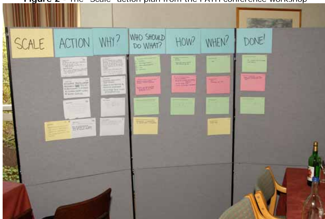
Figure 2 - The "Scale" action plan from the PATH conference workshop

The first suggestion in the final action plan was to look into how new tools of the information society could be used in participatory processes . This was considered because participants thought that new technologies have potential that has so far not materialised. Information and communication technologies (ICT) could be open new possibilities, and be efficient at facilitating involvement of large numbers of people in different locations and (to some extent) in different cultural contexts. The action planners suggested that this was something that should be carried out by researchers, technology companies, participatory practitioners, NGOs and governments. Greater ICT use could be encouraged and explored if funding was provided and existing tools were disseminated and