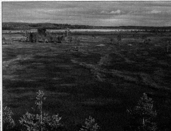
Figure 1. A pristine peatland.

research has shown that under some conditions, Sphagnum mosses (also called peat mosses), the main peat builders, can reestablish on former surfaces of bare peat (Grosvernier et al. 1995; Figures 3 and 4). Although much more needs to be understood about these processes, it is possible to envision the active restoration of bare mined peatlands (Grosvernier et al. 1995; Girard et al. 2002; Gorham and Rochefort 2003).