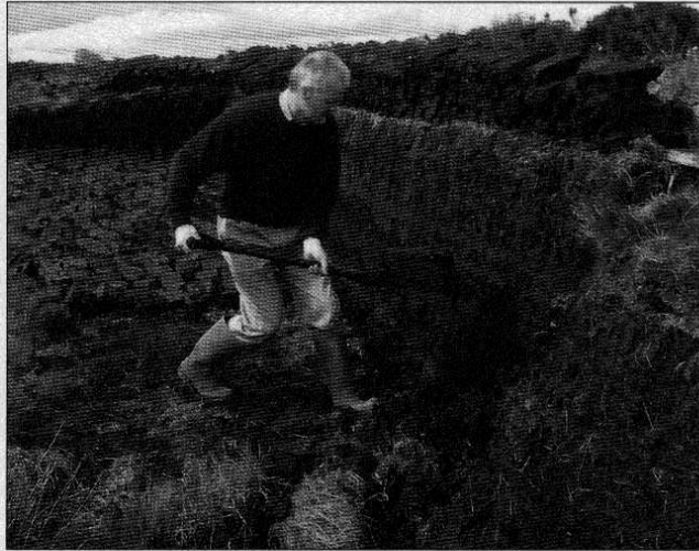
Figure 5. Traditional peat cutting in Scotland. This kind of relatively low-impact exploitation of peatlands may increase biodiversity by recreating transitional habitats.

In countries such as Switzerland, where the total surface area of remaining peatlands is small, several rare or endangered species now benefit from secondary habitats created by former peat extraction activities. These include the peat mosses Sphagnum affine , Sphagnum contortum , Sphagnum fimbriatum , Sphagnum teres , and Sphagnum warnstorffii , which are restricted to fens or often found in secondary bog vegetation (Feldmeyer-Christe et al. 2001), as well as dragonfly species such as Leucorrhinia pectoralis , Aeshna subarctica , Lestes virens vestalis , and Coenagrion hastulatum . The latter are found in the transitional habitats that often develop in peat extraction ditches (eg Sphagno-Utricularion , Caricion lasiocarpae , or Magnocaricion plant communities), but are absent from the late-succession stages of bog development (Delarze et al. 1998). In Sweden, it was found that the regional diversity of peat mosses had been increased in old hand-cut pits after spon-