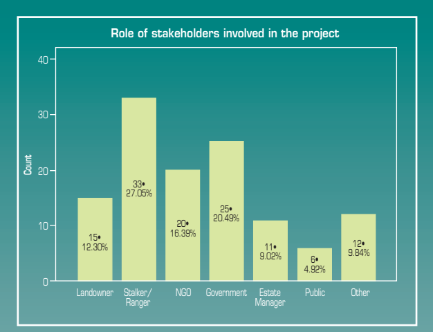
Figure 2 illustrates which activities they were involved in. Choice