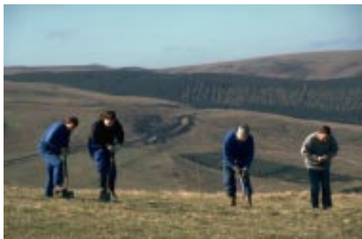
Excavating soil for greenhouse experiment, Sourhope Research Station.

We know a great deal about how pastures and woods are affected by acid rain, soil erosion and other factors, but very little is currently known about the underground interactions between plants and the soil microorganisms. It is important to increase our understanding of these interactions because in organic and other low-input sustainable farming systems plant growth is often governed by the supply of nutrients from the soil, which in turn is dependent on the activity of the soil microorganisms.